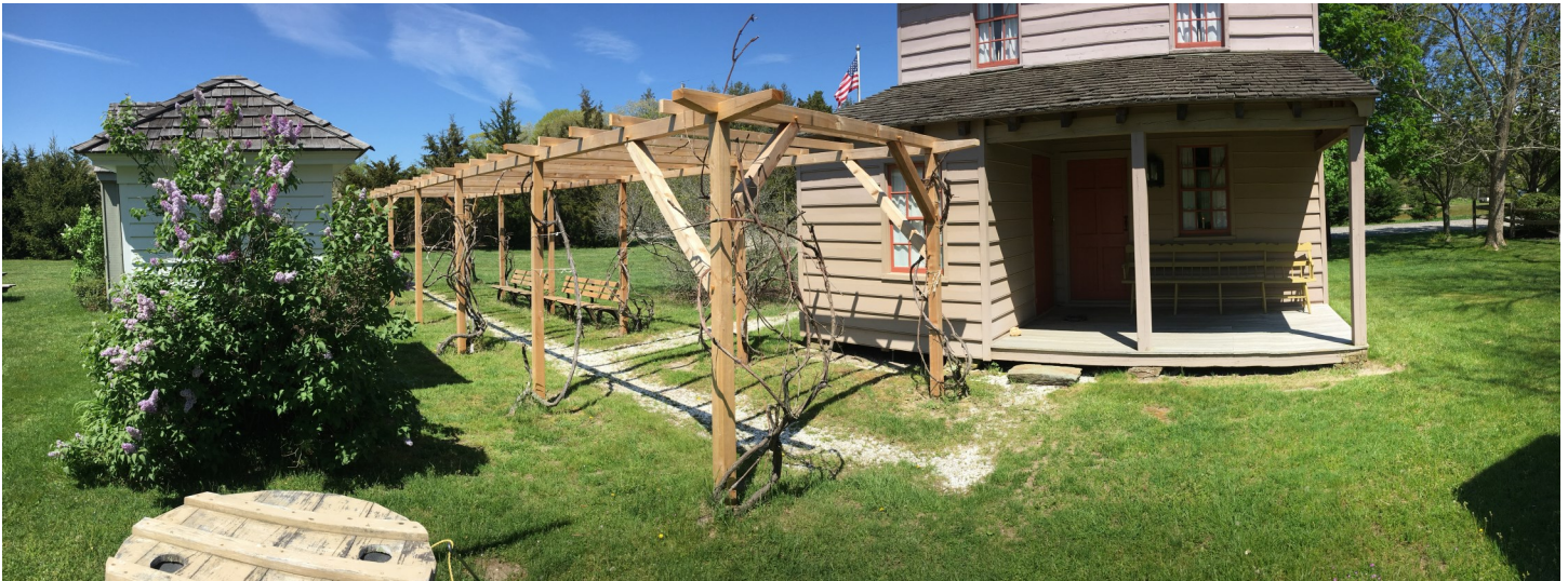
Dominick Serra, Eagle Scout Project - Full Re-build of the Gandy Farmstead Grape Arbor - March 2018 - Watch for detailed article in future SHOUT Newsletter