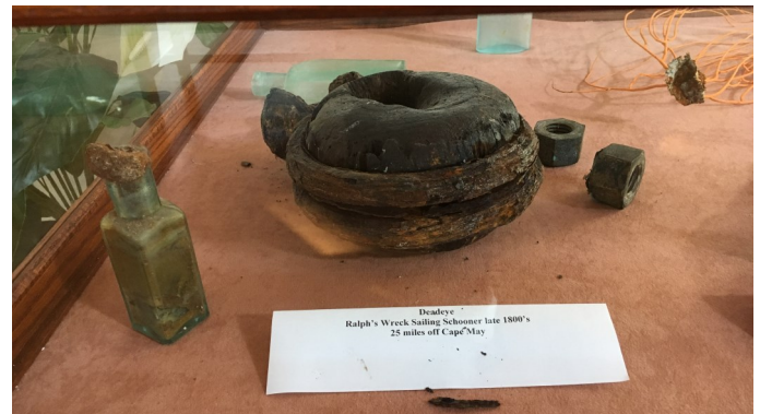
Ralph's Wreck Sailing Schooner , late 1800's, 25 miles off Cape May. NJ Wreck Divers link > https://tinyurl.com/y7z5zode

Visit the Small Museum (Roundtable) Committee for Cape May County New Facebook Page > www.facebook.com/SMR-cmc