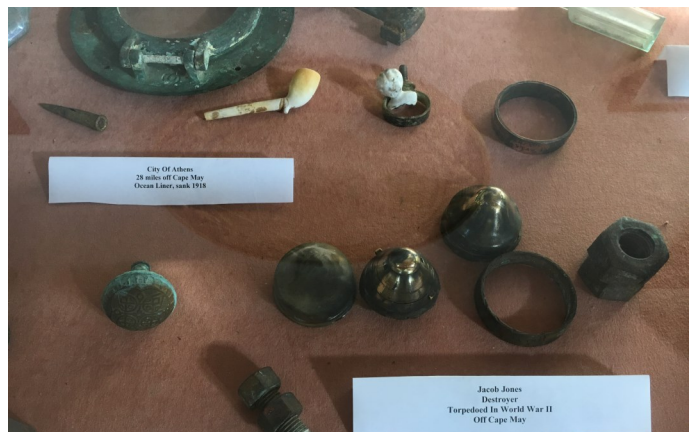
Artifacts from the Jacob Jones Destroyer - torpedoed off the coast of Cape May, New Jersey during WWII.

- Press of AC article on ship > https://tinyurl.com/ybqz8pkn