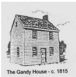
The Gandy House - c. 1815