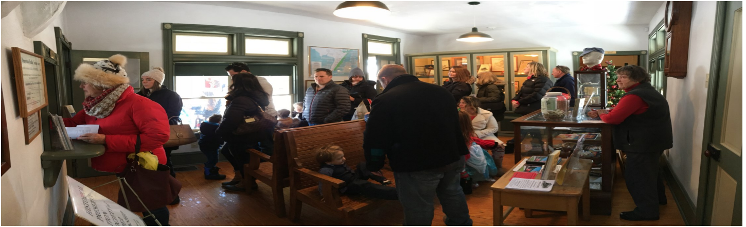
Warm hospitality in the Historic Tuckahoe Train Station will be a welcome stop for passengers bound for the Santa Express trains this holiday in Cape May County's Upper Township.

File: SHOUT_ Newsletter _Winter 2019_v1.0_07Dec2018.pub