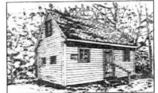
Friendship School - Circa 1830

Historical Preservation Society of Upper Township (HPSUT)