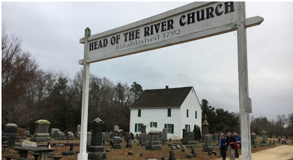
Historic 1792 Head of the River Church annual Christmas Service, Route 49, west of Tuckahoe, in Estell Manor.