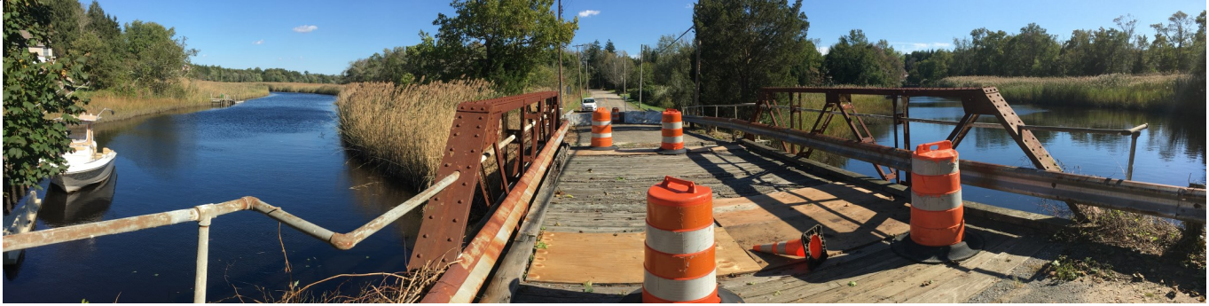
Marshallville Bridge , a "Pony Truss " bridge on Marshallville Road over Mill Creek, in the Tuckahoe Historic District, Cape May Co.