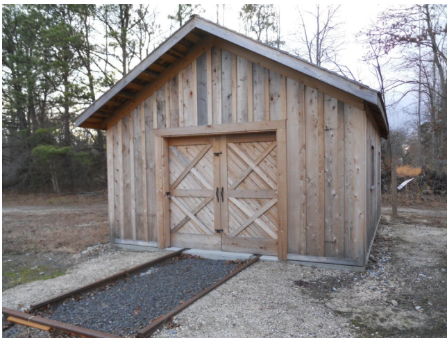
Speeder Shed @ Tuckahoe Train Station File photo (2014)

A Night Photo session will be held, starting ½ hour before sunset, with scenes set up to include all of the rail equipment on display/used during the day. A maximum of 30 tickets will be offered for sale at $30 per person. ###