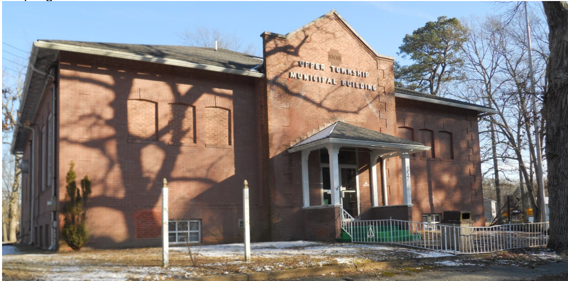
Old Twp. Hall in Tuckahoe, the proposed site of the History Museum for the Township of Upper