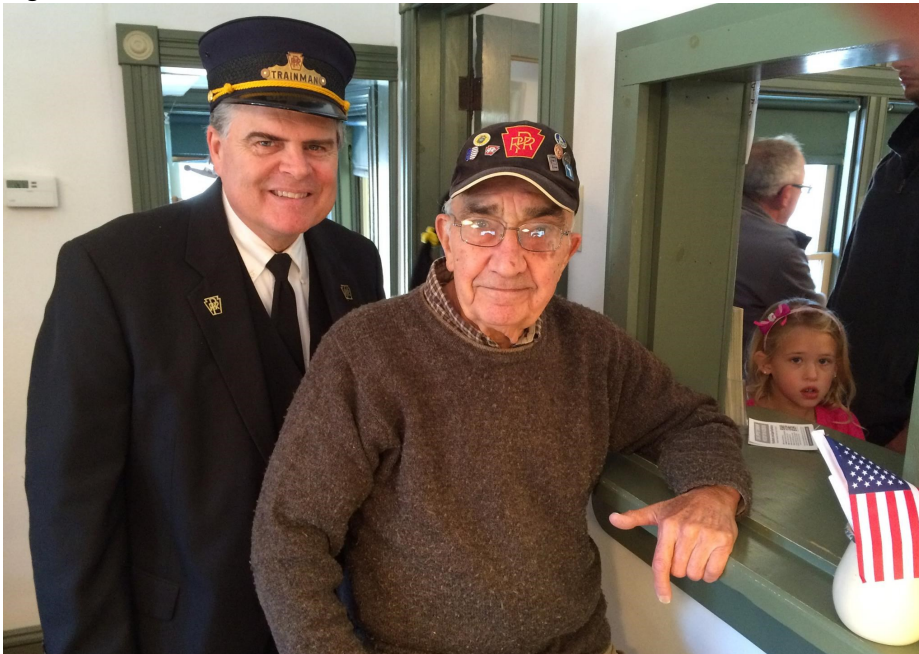
Railroading volunteers at the Tuckahoe Train Station