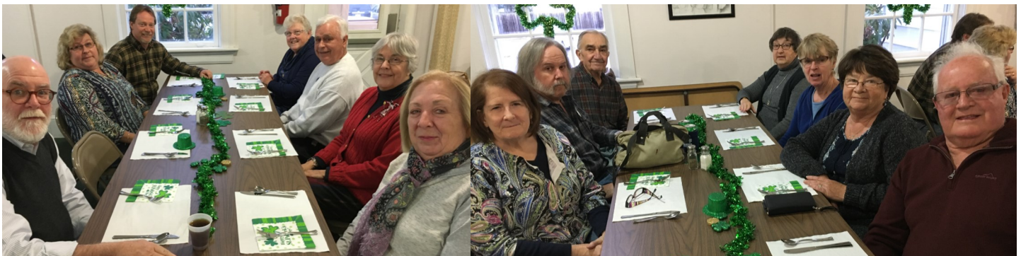
Attendees at the Upper Twp. Historical Society's March 2017 covered dish dinner at the Tuckahoe Methodist Church.

December TBD - Board of Trustees at the Train Station