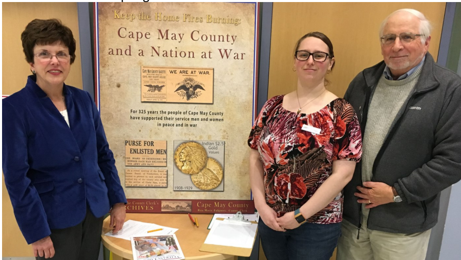
Keep the Homefires Burning: Cape May County and a Nation at War