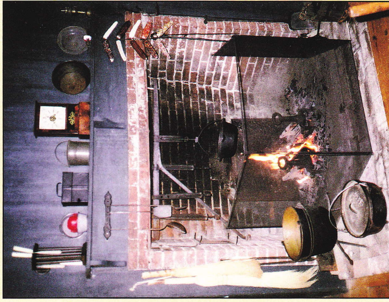
Hearth of the Gandy House

Rooted in the Past Enjoyed in the Present Preserved for the Future